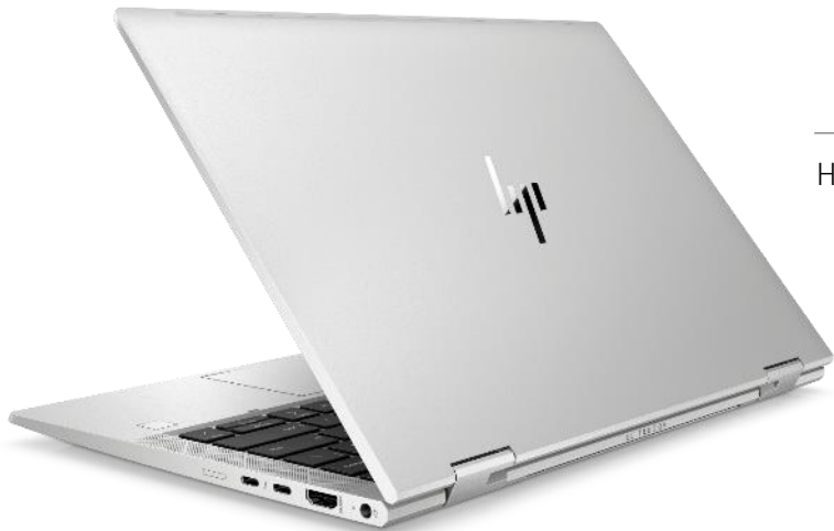
HP EliteBook 805 Series G8

HP IS COMMITTED TO DELIVERING THE WORLD'S MOST SUSTAINABLE PC PORTFOLIO 92